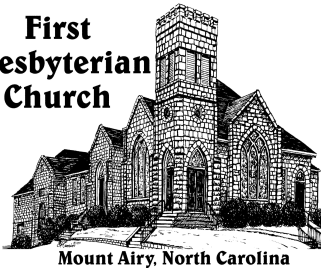
Mount Airy, North Carolina