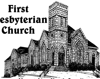
Mount Airy, North Carolina